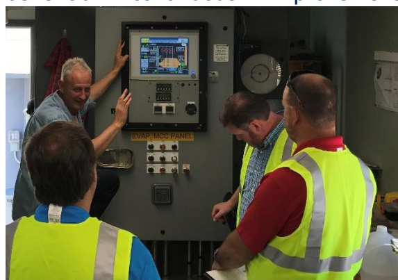
Figure 4- A Brunner Landfill engineering manager discusses the operations and controls of the Heartland Concentrator.

Since commissioning in December 2015, this combined landfill gas and leachate management system has operated successfully without major issue. The Heartland Concentrator has demonstrated both >95% volume reduction of landfill leachate and >95% availability; Heartland continues to work closely with site personnel to identify cost-effective improvements to achieve even better performance. This close customer relationship is a hallmark of Heartland Water Technology's core company values, as it strives for mutually beneficial continuous improvement.