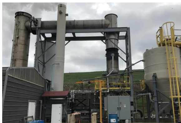
Figure 1 Heartland Water Technology Concentrator in operation at Brunner Landfill.

Heartland Water Technology provides operational flexibility to work with variable gas flow, energy flow and evaporation rates from thermal energy obtained from landfill gas to treat leachate