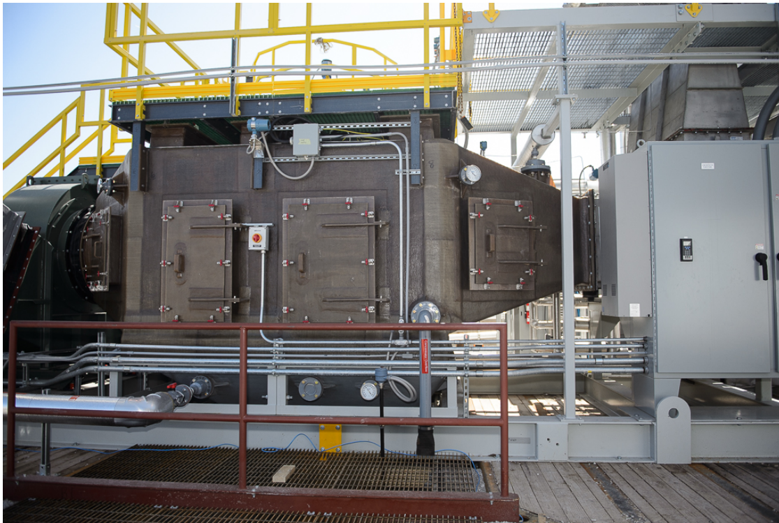
Figure 3. A side view of the Heartland Concentrator at Power Plant.