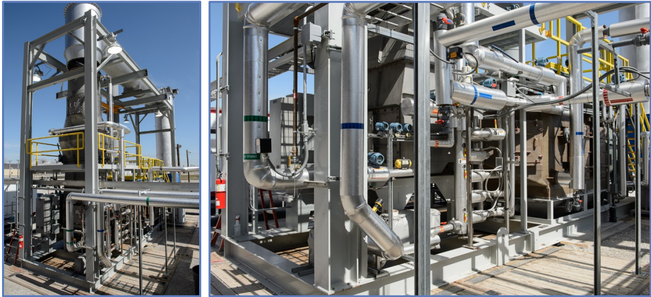
Figure 1. Heartland Water Technology Concentrators in Operation at Coal Power Plant.