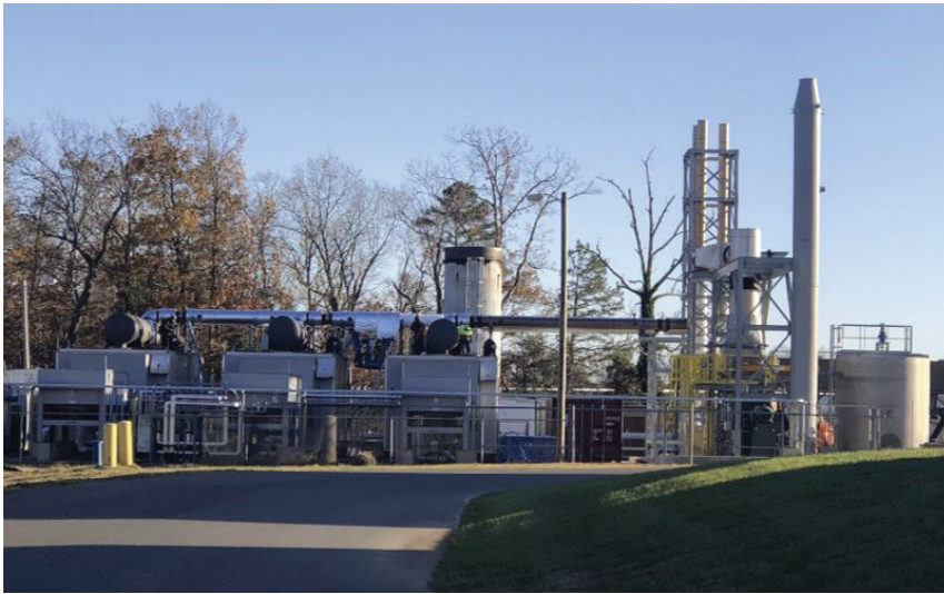
Figure 1. Profile view of the Heartland CoVAP Leachate Evaporation Facility