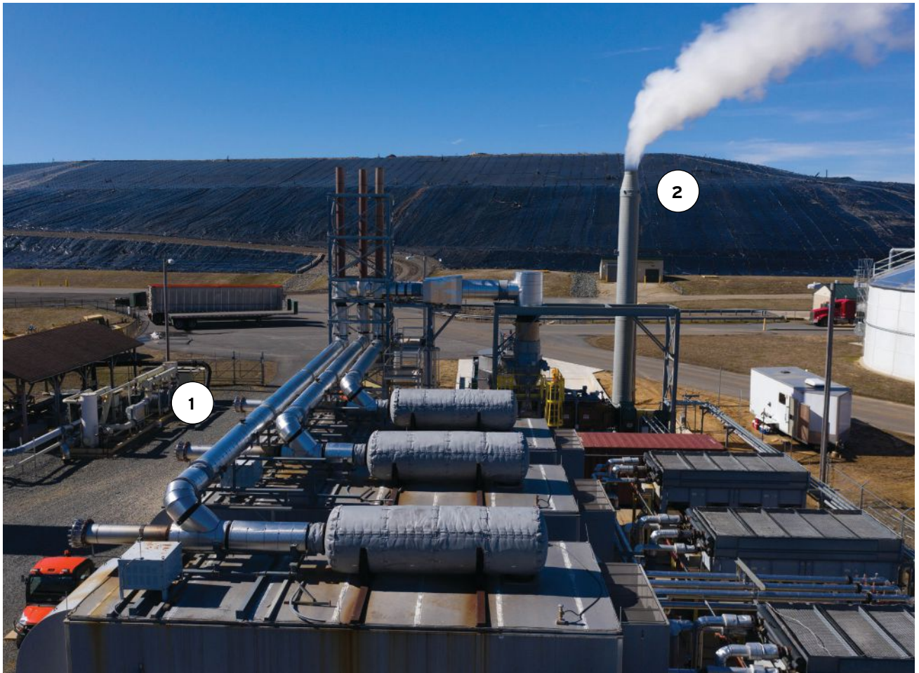
Figure 4. (1) Hot generator exhaust gas is ducted together to provide thermal energy for evaporation in the Heartland Concentrator (2).

patented for using waste heat from engines or turbines beneficially to evaporate wastewater. This is a classic Cogeneration solution.